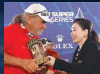
The Queen and the Gladiator: Her Majesty Queen Suthida of Thailand presents the winner's trophy at Puerto Portals 52 Super Series Sailing Week, in August.

In common with Langley businesses, 52 Super Series yacht racing represents the very best technology in its field, attracts talented people dedicated to achieving excellence through teamwork and is conducted with the highest standards of integrity.