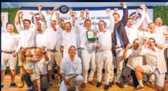
Gladiator Sailing Team are crowned World Champions at the NYYC ROLEX 52 World Championship held in Newport RI in July.

The Group's Gladiator Sailing Team competed against twelve other teams from eight different nations in the 2024 52 Super Series, the world's premier monohull yacht racing circuit. In July the Gladiators were crowned NYYC ROLEX World Champions in Newport RI, USA, and went on to take their second regatta win of the season in Mallorca, Spain, in August.