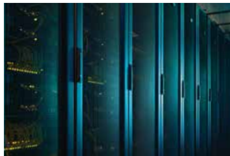
Piller returned to the hyperscale data centre sector with its M+ Series Battery UPS at Data Centre World Frankfurt in May.

In the Asia Pacific region, Piller Australia exceeded its target significantly. Piller Singapore meanwhile exceeded its budgeted profit despite a slow-down in semi-conductor projects while the nascent subsidiary in China also contributed positively.