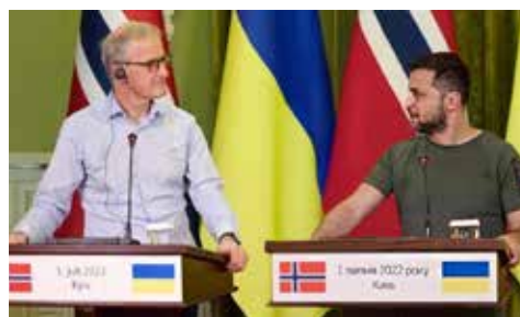
Norway's Prime Minister Gahr Støre announced "crucial" Ukraine contract with Bergen Engines.

business improved further in 2024, building on what was a very solid 2023. Subsidiaries in Bangladesh, Spain, Italy, Denmark, the UK, USA and Mexico all contributed to what was a record year for Bergen Engines.