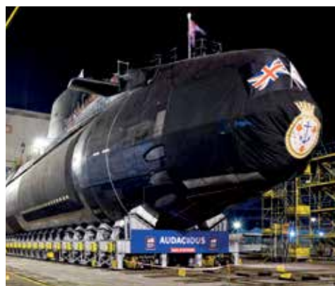
Transfer cars contributed to a record 2024 for Clarke Chapman.

Overall, a positive, albeit modest, performance by Claudius Peters and a moderately improved outlook for 2025.